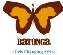
The Batonga Foundation