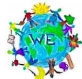
World Education Foundation